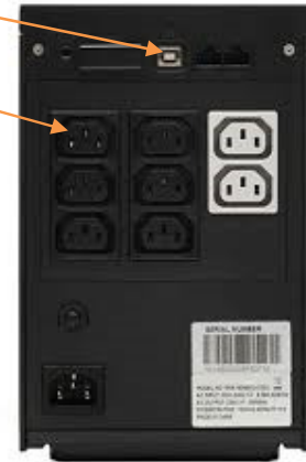
Figure 1.1 – Smart-Net v2.1